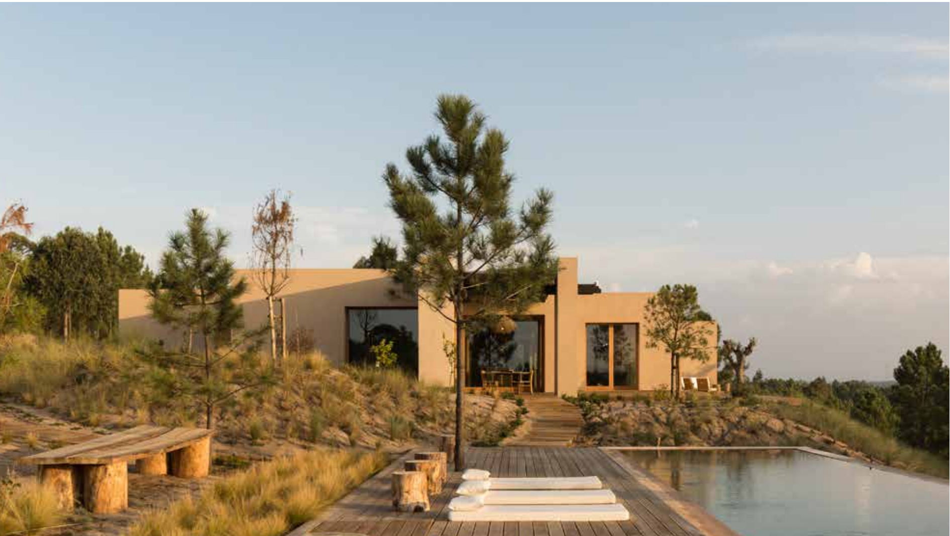
Unwind, surrounded by the stunning Alentejo landscape.