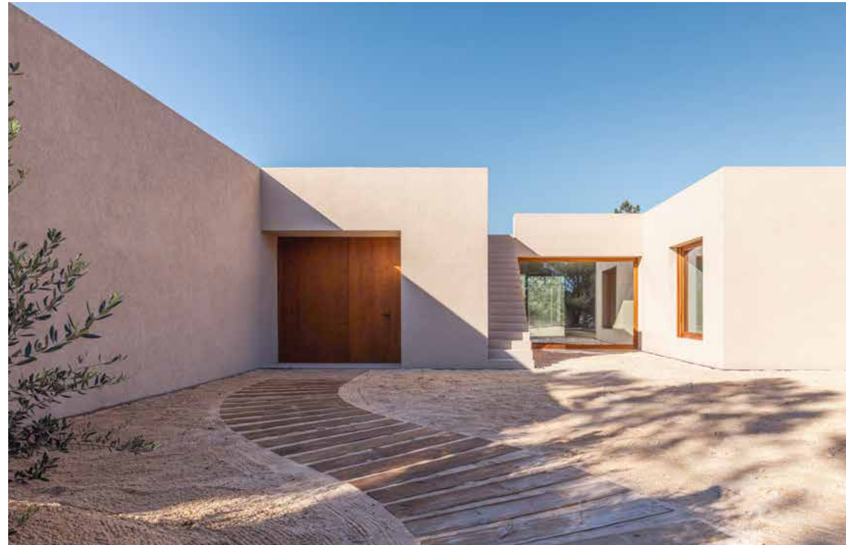
Your hidden gem. A secluded exclusive retreat.