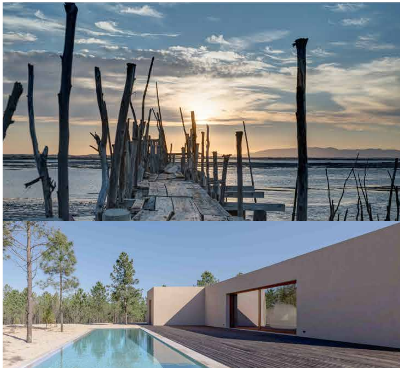
Carrasqueira stilt port.

Celebrated chefs draw inspiration from ancient culinary traditions, serving exquisite dishes at beach clubs and restaurants. Meanwhile, the region's cultural offerings, from architecture to interior design, reflect a commitment to preserving the past while embracing the future.