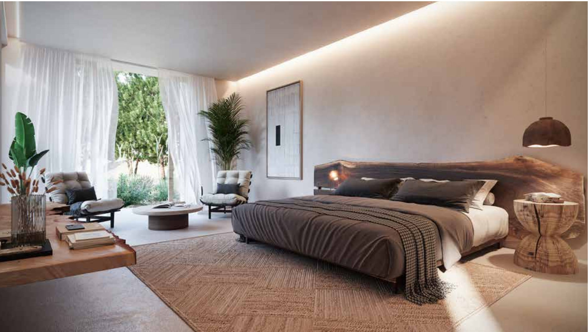
Wake up to paradise. Bedrooms offering stunning outdoor views surrounded in inner luxury.