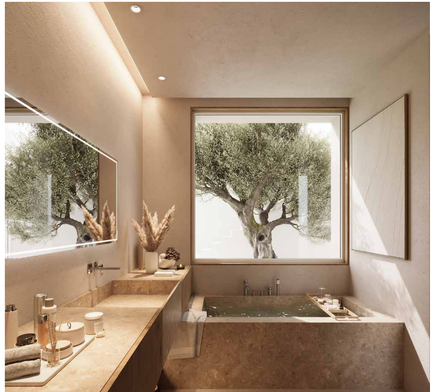
Escape to the serenity. Our bathrooms are designed to be a tranquil oasis, where you can unwind and rejuvenate.