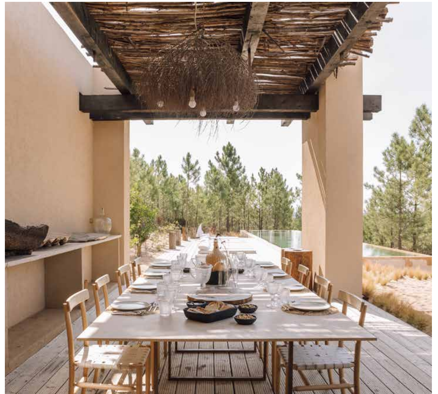
Savour every moment in nature in the beautiful outdoor area.