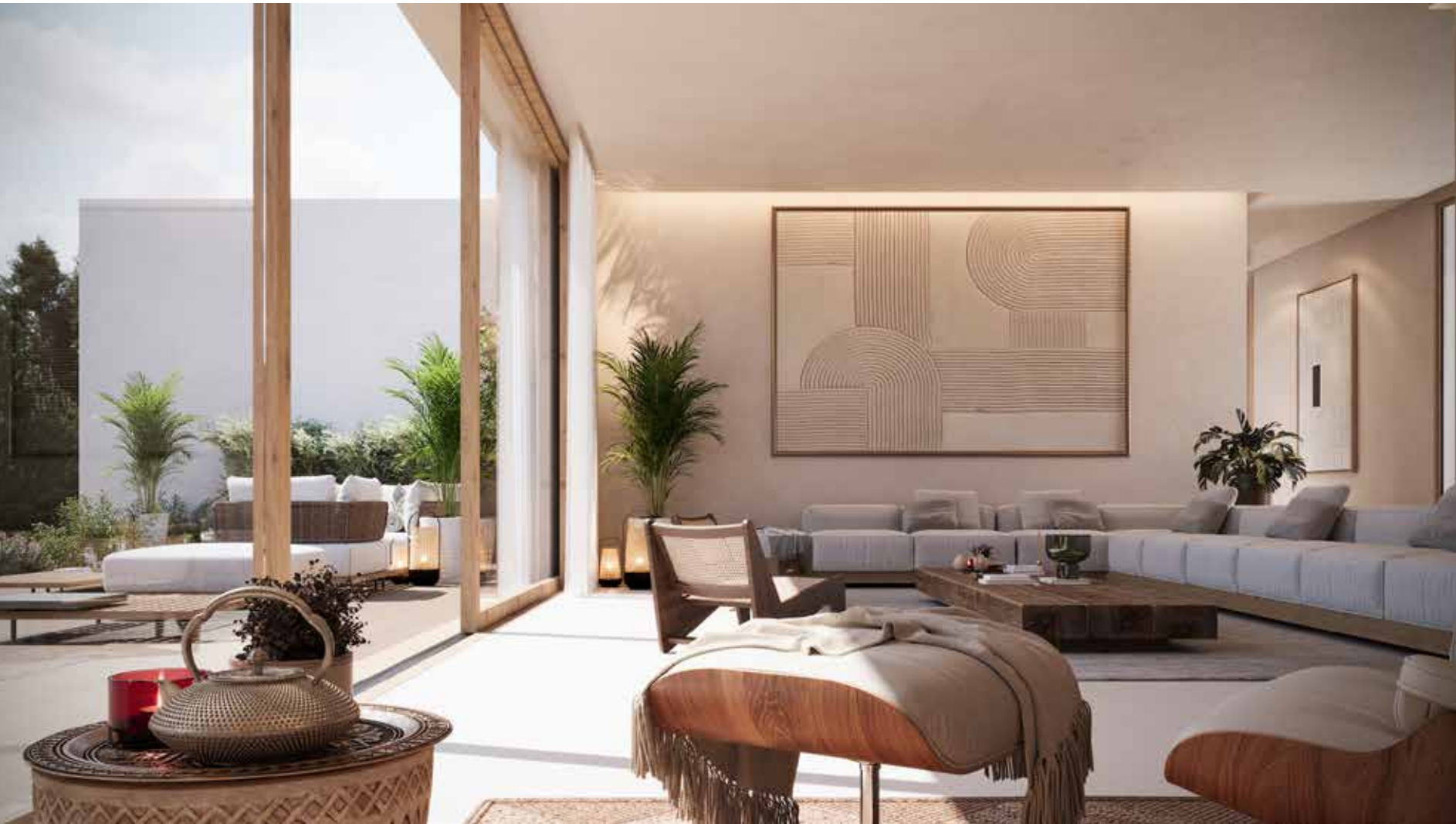
Large open spaces and the extreme height of the ceiling provide not only a solar gain, but a feeling of living at one with nature.